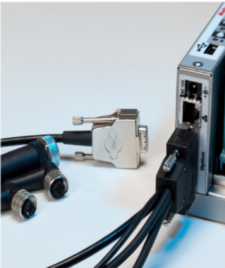
Interface options Direct Connection of rotary encoder, sensor and status outputs