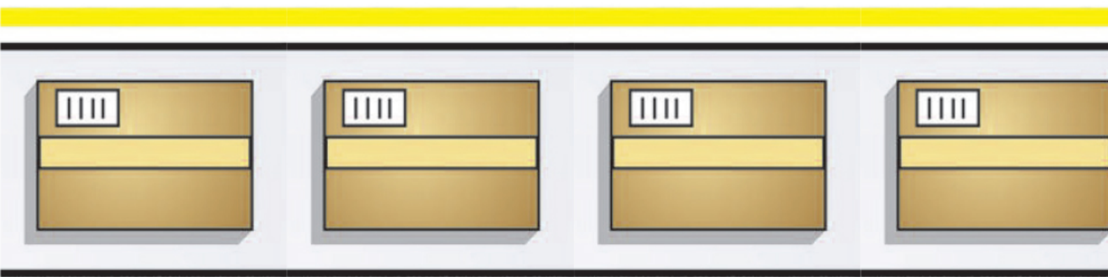
Markoprint X1JET Compact, independently operating printhead for simple integration into existing production lines.