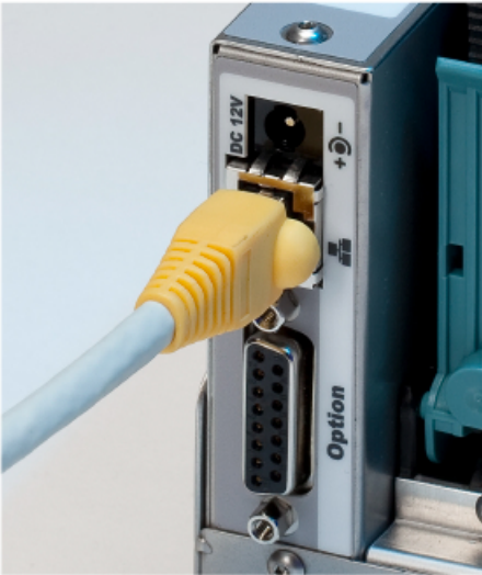
Ethernet Data transfer from networks and Web interface