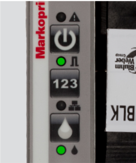
3-Logic User Interface LED indicators for intuitive use