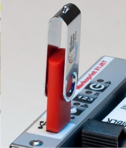
USB stick data transfer Dynamically transfers Data created with a PC to the printer